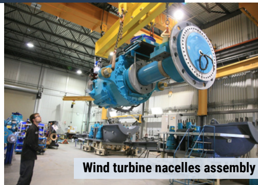
Wind turbine nacelles assembly