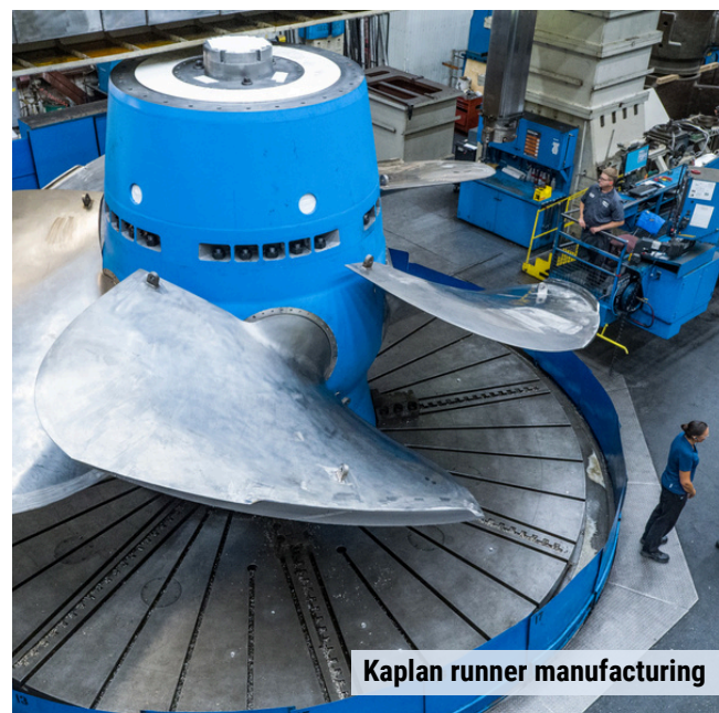
Kaplan runner manufacturing

Tel.: +1 819 379-0453 sales@marmeninc.com marmeninc.com