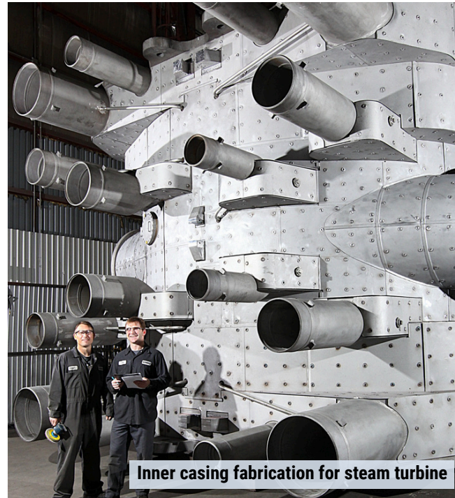
Inner casing fabrication for steam turbine