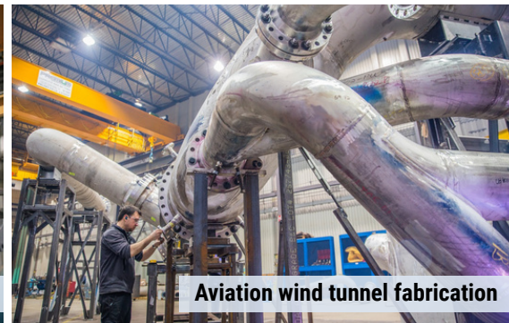
Aviation wind tunnel fabrication