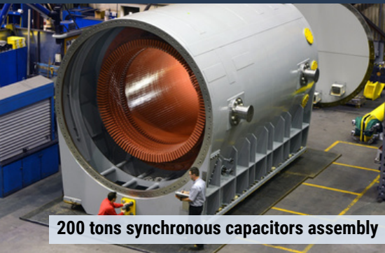
200 tons synchronous capacitors assembly

Marmen combines manufacturing expertise, infrastructure, capability and capacity to meet the delivery requirements of the first submarine and beyond.