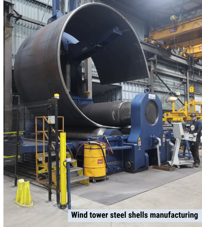
Wind tower steel shells manufacturing